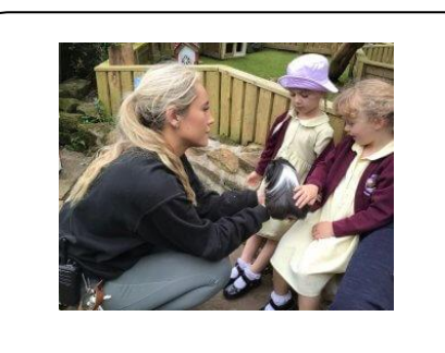
June 2024 Reception class enjoyed a visit to Williamson park linked to our minibeast topic.

Children with special educational needs will be supported as appropriate to enable them to access the curriculum fully. This includes children that are more able and those with specific learning difficulties and disabilities. Individual Education Plans identify targets in specific areas of learning for those children who require additional support commensurate with the school's Special Educational Needs Policy. The school's SEN Co-ordinator is responsible for providing additional information and advice to staff and parents and for arranging external intervention and support as necessary.