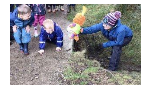
Visit to Beacon Fell – November 2024