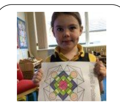
November 2024 We have been learning all about Diwali and how it is celebrated.