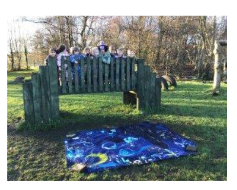
Weekly Forest School sessions 2024